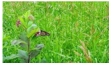
Monarch Butterfly feeding on common milkweed in open field