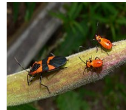
Giant milkweed beetle