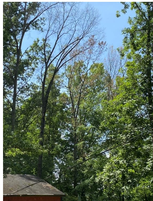
Figure 4. Pin oaks killed by oak wilt in northeastern Ohio

The fungal pathogen Bretziella fagacearum , which causes the disease oak wilt, has been known to occur in Ohio since at least 1950, but there has been a concerning increase in oak wilt infected areas since 2019, with some new infected areas reported in 2023. New and existing infections were identified in all regions of the state. This disease is deadly to oaks and the fungal spores can spread between trees aboveground via sap-feeding beetles and belowground through root systems of neighboring trees that have grown together, or “grafted.” Ohio Division of Forestry is working with landowners to help manage oak wilt infections on private land as well as on Ohio Department of Natural Resources (ODNR)-owned properties. The ODNR Division of Forestry convened an