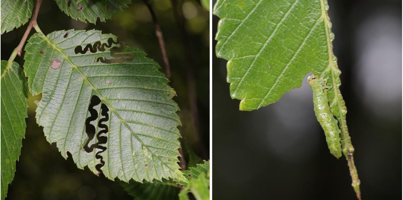
Figure 1. Zigzag pattern on elm leaf (left) and elm zigzag sawfly larva (right).

being planned by the U.S. Forest Service NRS, Ohio State University, Bowling Green State University, and others.