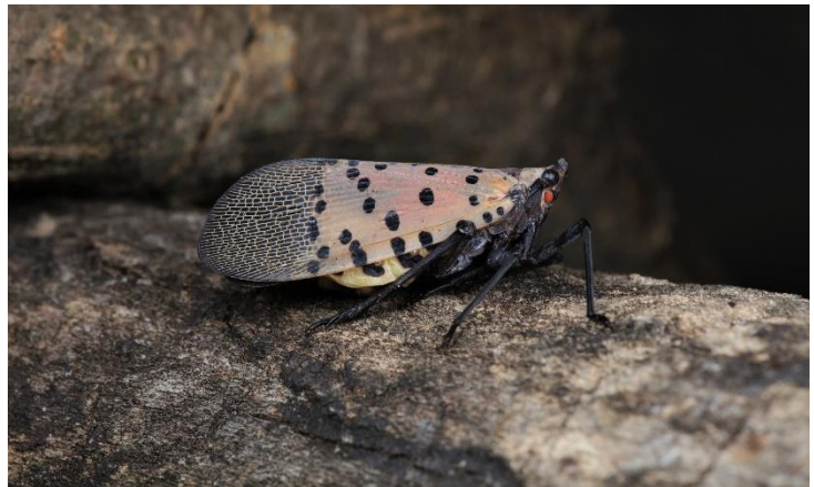
Figure 2. Adult spotted lanternfly

This planthopper insect is native to Asia and was first documented in North America in southeastern Pennsylvania in 2014. It has since spread to several other Northeastern and Mid-Atlantic states. Ohio's first known spotted lanternfly infestation was discovered in 2020. Eleven counties are currently under a spotted lanternfly quarantine by the Ohio Department of Agriculture to reduce the spread of the insect (eight counties added in 2023). In 2023, confirmed sightings of spotted lanternfly increased in many parts of the state and efforts to delineate infestations are ongoing.