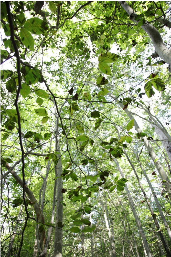
Figure 5. Forest understory heavily impacted by beech leaf disease (Credit: Ohio Division of Forestry).

A decline of American beech (and potentially several other non-native beech species) has been documented in northern Ohio since 2012. This decline is being referred to as beech leaf disease (BLD) and was first noted in Lake County and is now known to be present in parts of northern Ohio, the Canadian province of Ontario, and several Northeastern states. In 2023, beech leaf disease was detected in nine new counties in Ohio. Symptoms are first noticeable as dark interveinal striping on leaves, and progress over a period of one or more years to stunted and distorted leaves, reduction in leaf and bud production, and branch dieback. Mortality of understory trees and saplings has been documented. The causal agent of beech leaf disease is believed to be a species of foliar nematode ( Litylenchus crenatae ssp. mccannii ). Since 2021, the Ohio Division of Forestry in partnership with Holden Forests & Gardens, has sampled American beech (as well as maple and oak species) buds from 24 counties across the state. Analysis identified nematode DNA at roughly half the sites, fairly evenly distributed across the state, including areas far from where beech leaf disease symptoms are known to occur. Nematode DNA was also detected from some oak and maple buds. Those sites that were positive for nematode DNA were re-visited in order to be examined for beech leaf disease symptoms as