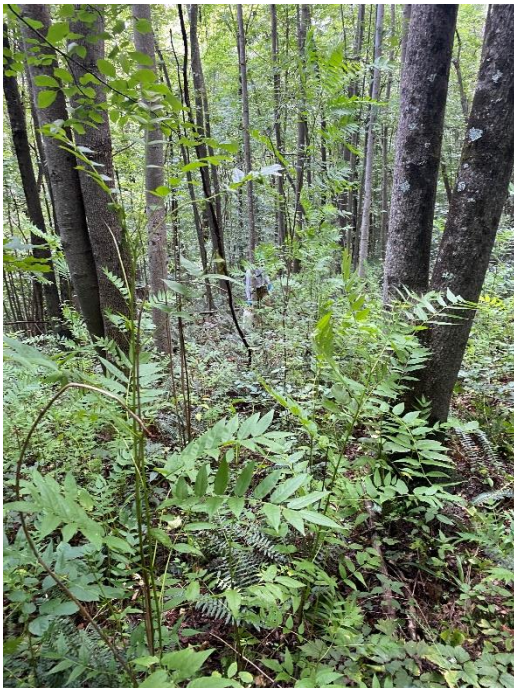
Figure 12. Forest infestation of tree-of-heaven ( Ailanthus altissima ) (Credit: Ohio Division of Forestry).

Non-native invasive plants are a threat to the biodiversity of forests throughout Ohio. Some forests contain dense infestations of invasive plants such as Ailanthus , Asian bush honeysuckles, autumn-olive, multiflora rose, and Japanese stiltgrass, while other areas remain largely uninvaded. In 2022, new infestations of Japanese angelica tree ( Aralia elata ) and a hybrid crabapple ( Malus spp.) were identified and reported in parts of eastern and central Ohio, respectively. Efforts are underway to document the extent of these species and explore treatments to reduce their populations. In 2018, over 30 species of invasive plants were banned from sale and propagation in Ohio. Callery pear ( Pyrus calleryana ; including the popular ‘Bradford’ variety), which had a 5-year phase out period, was banned from sale starting in January 2023. In early 2023, the Ohio Division of Forestry hired two new 3-person crews focused largely on invasive plant control, based at Shawnee and Zaleski state forests. To date, they have completed over 600 acres of