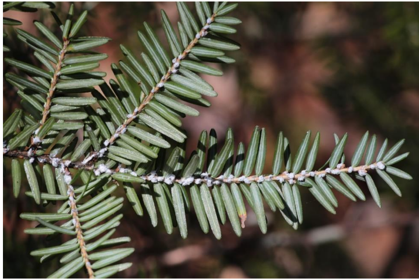
Figure 8. Eastern hemlock branch infested with hemlock woolly adelgid.

Two non-native, invasive insects of concern that infest eastern hemlock trees are present in Ohio. Hemlock woolly adelgid (HWA) is known to be present in 21 counties (one new county identified to date in 2023; Ross), while elongate hemlock scale (EHS) is present on yard and planted hemlock trees in several parts of Ohio, but only known to be infesting hemlock forests in northeastern Ohio. In 2023, the Ohio Division of Forestry treated roughly 5,000 eastern hemlock trees across 600 acres with the insecticide