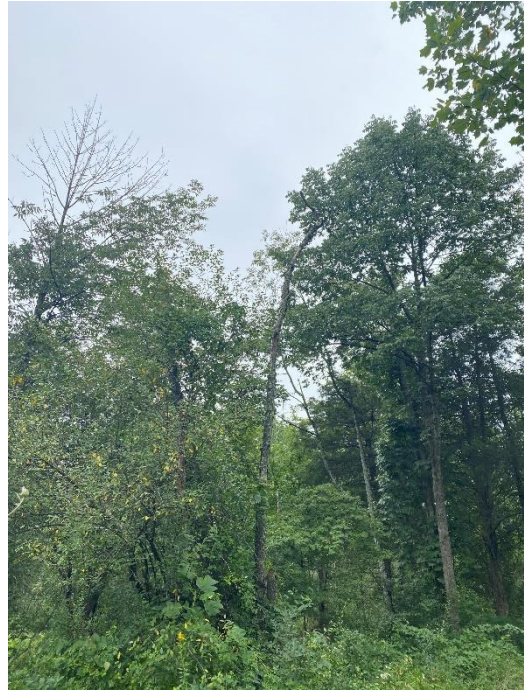
Figure 11. Healthy “lingering ash” (on right) amongst ash trees killed by emerald ash borer in southwestern Ohio (Credit: Ohio Division of Forestry).

and the Great Lakes Basin Forest Health Collaborative, conducted survey and site visits for surviving mature ash trees (termed “lingering ash”). Healthy lingering ash were identified in several counties and are planned to be sampled for testing against emerald ash borer and possible future propagation in a breeding program for emerald ash borer tolerance. The Ohio Division of Forestry continues to help woodland owners manage their forests and utilize their ash resources, assist communities that are dealing with EAB issues, and promote the identification and reporting of lingering ash.